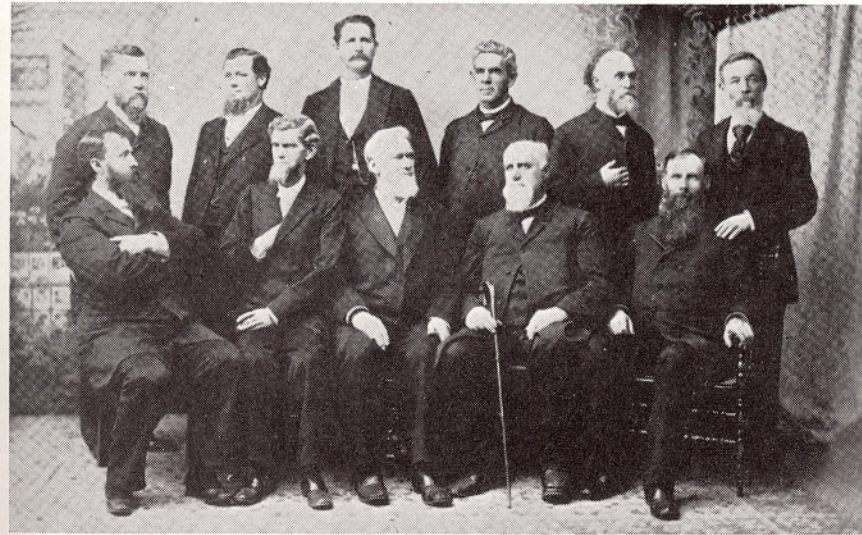
Charter members, Southern California Conference