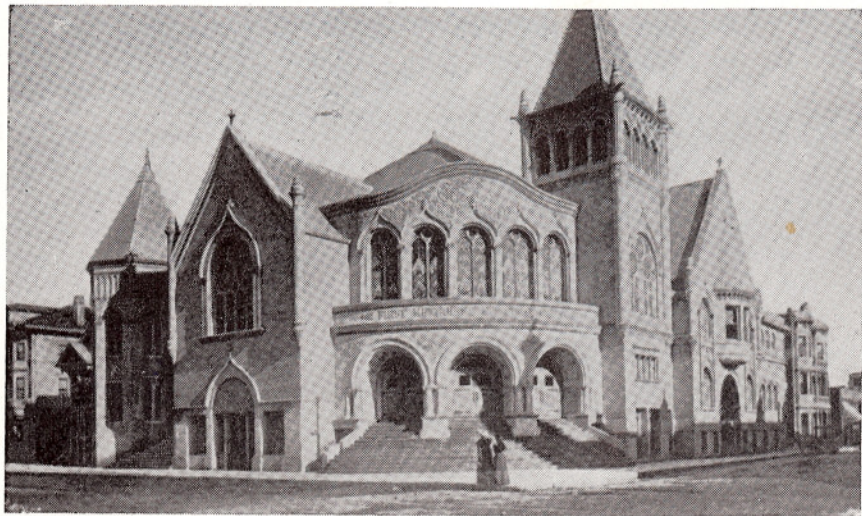
First Methodist Church, Los Angeles, present home

His optimism evidently sustained him. He leased El Dorado, a saloon located on Main Street near the town's Plaza, and transformed it into a chapel, while his wife conducted a school for girls. 8 Because of lack of funds, plans for a church had to be abandoned. It was not until 1868 that a permanent structure was erected, the first in southern California for the Methodist Episcopal Church.